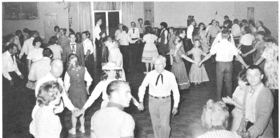
FAMILY DANCE —With derby hats, red armgarters, bonnets and bustles, the Fontana members enjoy a "Gay Nineties" square dance.

It truly was a GAY Nineties night of food, fellowship and fun!