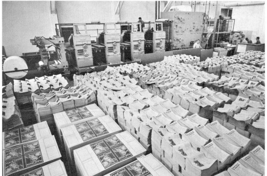
MAIN PRESS —Key to publishing division's new expansion program is this giant web press. Here you see part of June PLAIN TRUTH in foreground. WHO WILL RULE SPACE? was first full-color booklet printed on the press.